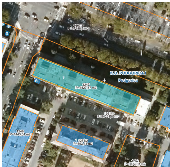
View of the cadastral plot for the building in where the real estate is located (GeoPortal Crne Gore)

MUNICIPALITY-----PODGORICA CADASTRAL MUNICIPALITY-----KO PODGORICA I PROPERTY AREA-----94m 2 PROPERTY PRICE IN EUR-----ON REQUEST ID NUMBER-----ME10287B01001