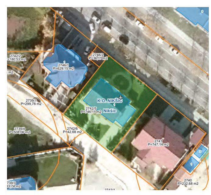
View cadastral plot with a house (GeoPortal Montenegro)