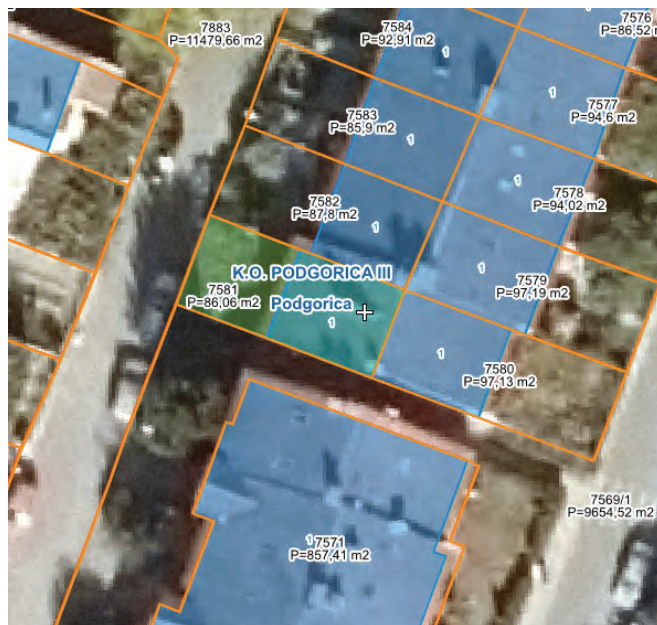
View cadastral plot with the building (GeoPortal Montenegro)

MUNICIPALITY-----PODGORICA CADASTRAL MUNICIPALITY-----KO PODGORICA III PROPERTY AREA-----79m 2 PROPERTY PRICE IN EUR-----ON REQUEST ID NUMBER-----ME10266B01001