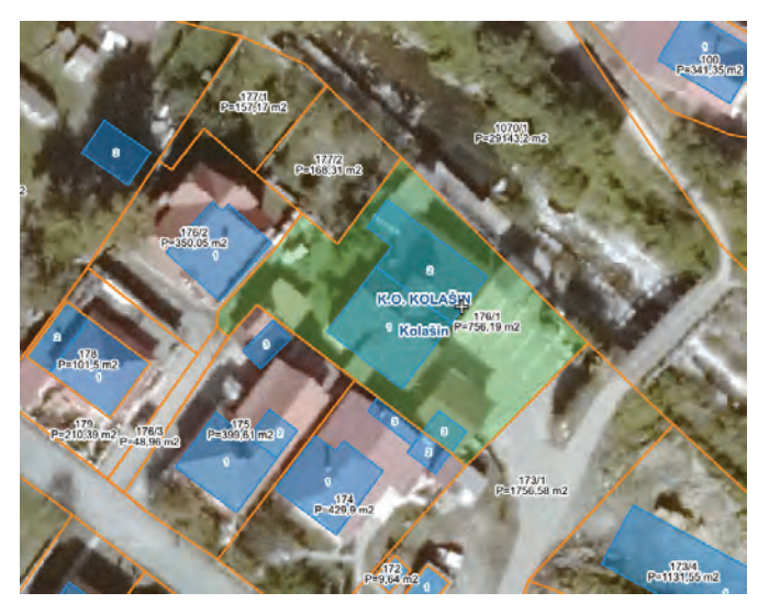
View cadastral plot with a house (GeoPortal Montenegro)