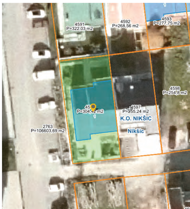
View cadastral plot with a house (GeoPortal Montenegro)

MUNICIPALITY-----NIKŠIĆ CADASTRAL MUNICIPALITY-----KO NIKŠIĆ PROPERTY AREA-----292m 2 PROPERTY PRICE IN EUR-----ON REQUEST ID NUMBER-----ME10256B01001