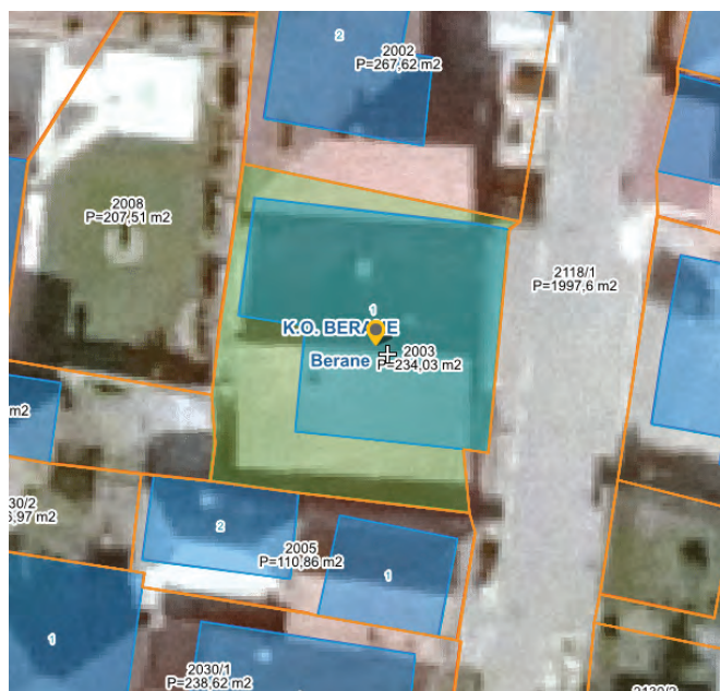
View cadastral plot with a house

MUNICIPALITY-----BERANE CADASTRAL MUNICIPALITY-----KO BERANE PROPERTY AREA-----345m 2 PROPERTY PRICE IN EUR-----ON REQUEST ID NUMBER-----ME10250B01001