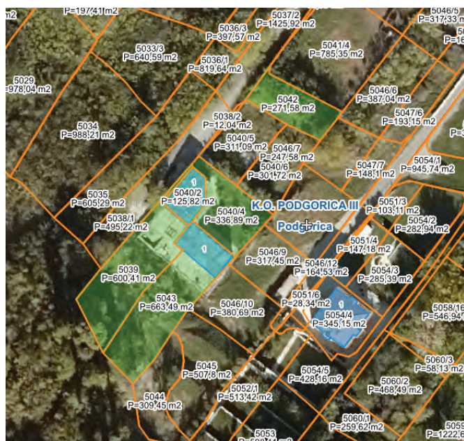
View cadastral plot with buildings (GeoPortal Montenegro)

MUNICIPALITY-----PODGORICA CADASTRAL MUNICIPALITY-----KO PODGORICA III PROPERTY AREA-----1873+348m 2 PROPERTY PRICE IN EUR-----ON REQUEST ID NUMBER-----ME10232B01001